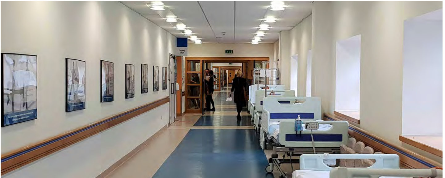
Thousands of NHS beds have been closed or left empty – as private hospitals cash in on the pandemic

NHS funded patients because these are more profitable.